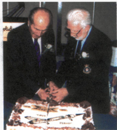
The two old friends cut the cake at the 40th. Anniversary of the first Flight