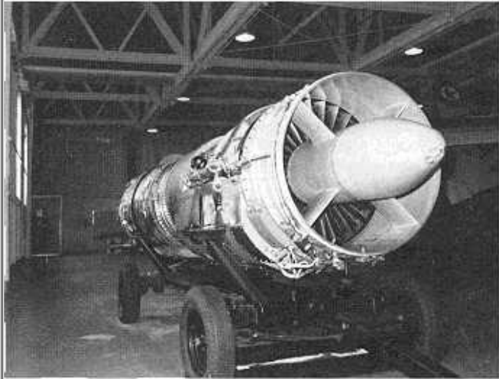
Orenda Engines, Toronto

Flight tested in a B47 but never in an Arrow, the Iroquois engine was 19 feet long, four feet in diameter and composed of some 20% titanium alloys overall. With a 1:1 weight to thrust ratio, it would have given the Arrow better than Mach 2 speed.